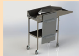
Infant Charging Trolley