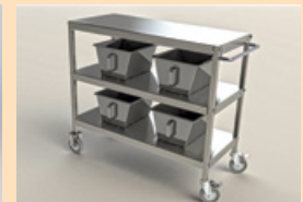
Ash Storage/Cooling rack