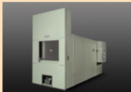
FT USA V2